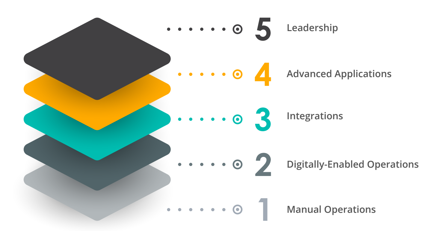
Figure 4 - The Five Levels of e-Governance Maturity

The advantage of arranging the levels in this manner is that as a ULB achieves one level, the subsequent level becomes its de facto target for further improvement.