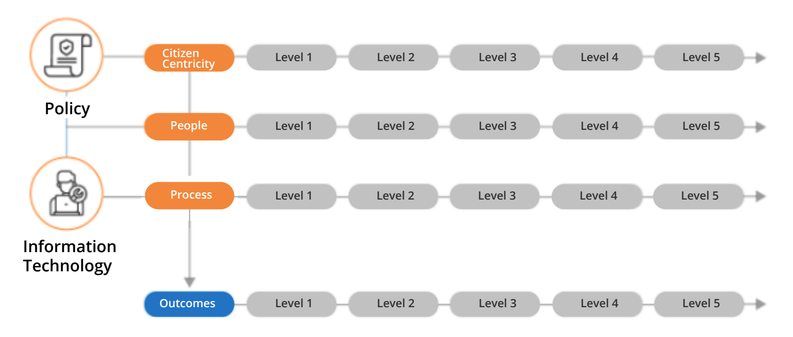
Figure 2 - An illustration of the e-Governance Maturity Framework